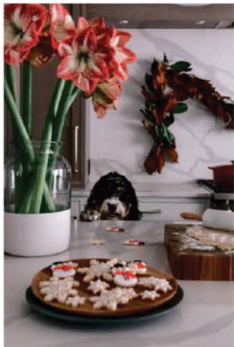
PIPER, THE DOG