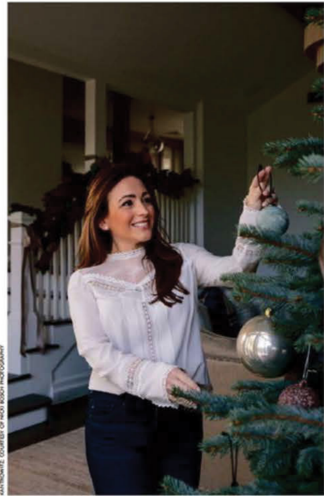
KANTROWITZ, COURTESY OF NICKI BOSCH PHOTOGRAPHY